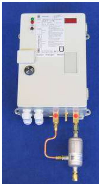
DLR-P 1.1 PM Weather protected design with integrated pressure indication