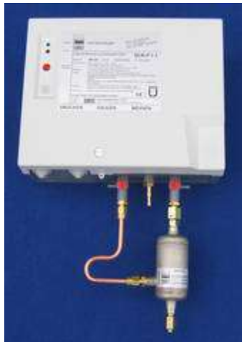
DLR-P 1.1 in plastic housing

for double walled pipes and double walled fittings in several variations: