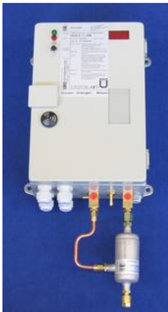
DLR-P 1.1 PM Weather protected design with integrated pressure indication