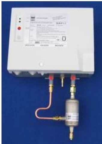
DLR-P 1.1 in plastic housing

for double walled pipes and double walled fittings in several variations: